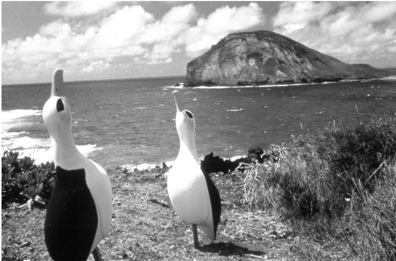
Fig. 3. Laysan albatross decoys in courtship pose at Kaohikaipu, an island in Waimanalo Bay, Oahu, Hawaii. (Photograph courtesy of Mark Rauzon, Marine Endeavors, Oakland, California).

Decoys and/or sound recordings of colonies have been used to induce colonially nesting seabirds to establish new breeding colonies for least tern ( Sterna antillarum ) (Kress 1983) and Atlantic puffin ( Fratercula arctica ) (Kress 1978, Kress & Nettleship 1988), and to attract wading birds to foraging sites (Crozier & Gawlik 2003). Using decoys as a cue to attract birds was taken further in the Laysan albatross ( Diomedea immutabilis ), where breeding site selection cues were refined by providing decoys of chicks and of adults in courtship poses (Fig. 3) (Podolsky 1990). The use of breeding cues has been effective for other types of birds as well. Endangered black-capped vireos ( Vireo atricapilla ) were attracted to new breeding sites using territorial song playback (Ward & Schlossberg 2004), and dispersing griffon vultures ( Gyps fulvus ) were attracted to abandoned breeding sites by spreading white paint to simulate conspecific feces (Sarrazin et al. 1996). Although manipulating breeding cues has not been tried for invertebrate conservation, I suspect taking advantage of aggregation and reproductive hormones, as is done for pest control ( see section ‘Pest deterrence and control’ below), could be a useful species conservation technique.