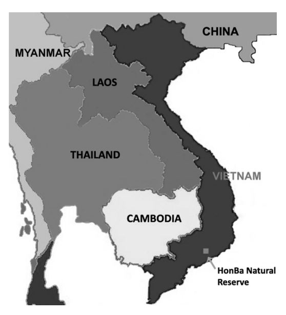
Fig. 1. Map showing the type locality of Cordiglottis longipedicellata in Vietnam.

Reserve, J. Lee et al. 10 April 2012 (HIKK, 1316 HN; iso-type KRIB!).