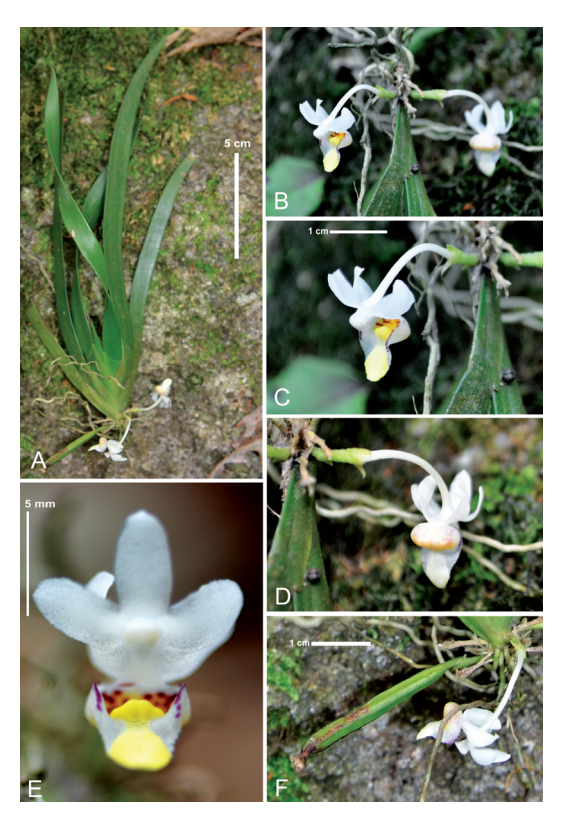
Fig. 2. Cordiglottis longipedicellata. -A: Habit. -B: Inflorescence. -C: Anterior view of flower. -D: Posterior view of flower. -E: Flower in front view. -F: Fruit.

Epiphytic herb, up to 20 cm long. Leaves 5–7, 18-20 \times 1-1.2 cm, laterally flattened, slightly curved, fleshy, dark green, tips acute, base overlapping. Inflorescence 2-flowered, pendulous, 2-2.3 cm long; peduncle 0.5-0.8 cm long, glabrous. Floral bracts triangular, thin, apex acute, 1.5-2 \times 1-1.5 mm. Flowers 2-2.5 cm diameter. Sepals white, translucent, glabrous, apex obtuse; dorsal sepal elliptic, 4-4.5 \times 1.8-2 mm, lateral sepals elliptic-ovate, 4-4.5 \times 1-1.5 mm, contracted at base. Petals white, similar to sepals, ovate, 5-5.5 \times 1-1.7 mm. Lip white with purple spots at base and on margin of side lobes, disc and callus yellow, saccate, glabrous, more or less sigmoid, without a spur, 3-lobed, 4-5 \times 2-2.5 mm; callus fleshy, glabrous, apex spatulate; side lobes erect, slightly angular-round, 3-4 mm long; midlobe almost flat at apex, slightly decurved, 6-7 \times 3-4 mm. Column 2-2.2 mm long; foot prominent, nearly as long; anther cap round, 1-1.5 mm long; pedicel and ovary 1-1.2 cm long. Capsules narrowly cylindrical, 4-5 mm long, ca. 5 mm thick, dark green, opening by