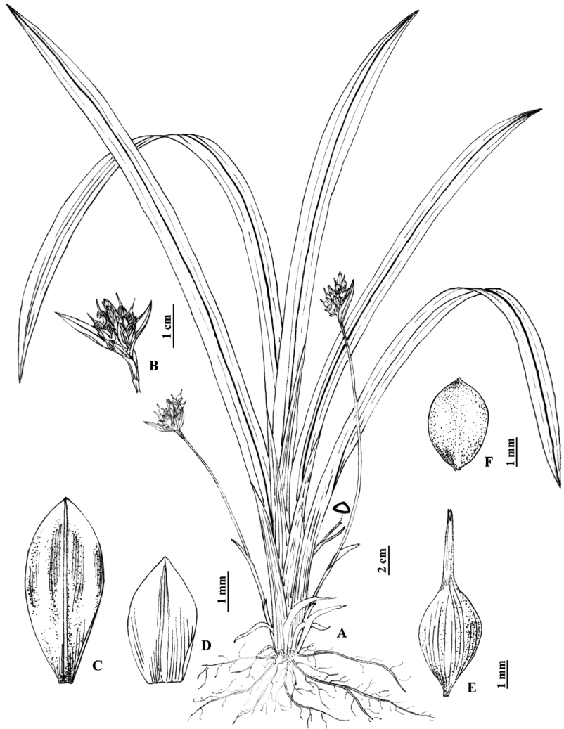
Fig. 1. Carex arisanensis subsp. ruianensis (from the holotype, drawn by Hong Wang). — A: Habit. — B: Inflorescence. — C: Staminate glume. — D: Pistillate glume. — E: Perigynium. — F: Achene.

long, shortly 2-toothed at orifice. Achenes tightly enveloped, obovoid, trigonous, fulvous, 3–3.5 mm long, truncate at apex, short-stipitate at base. Styles not thickened at base. Stigmas 3. Flowering and fruiting in April–May.