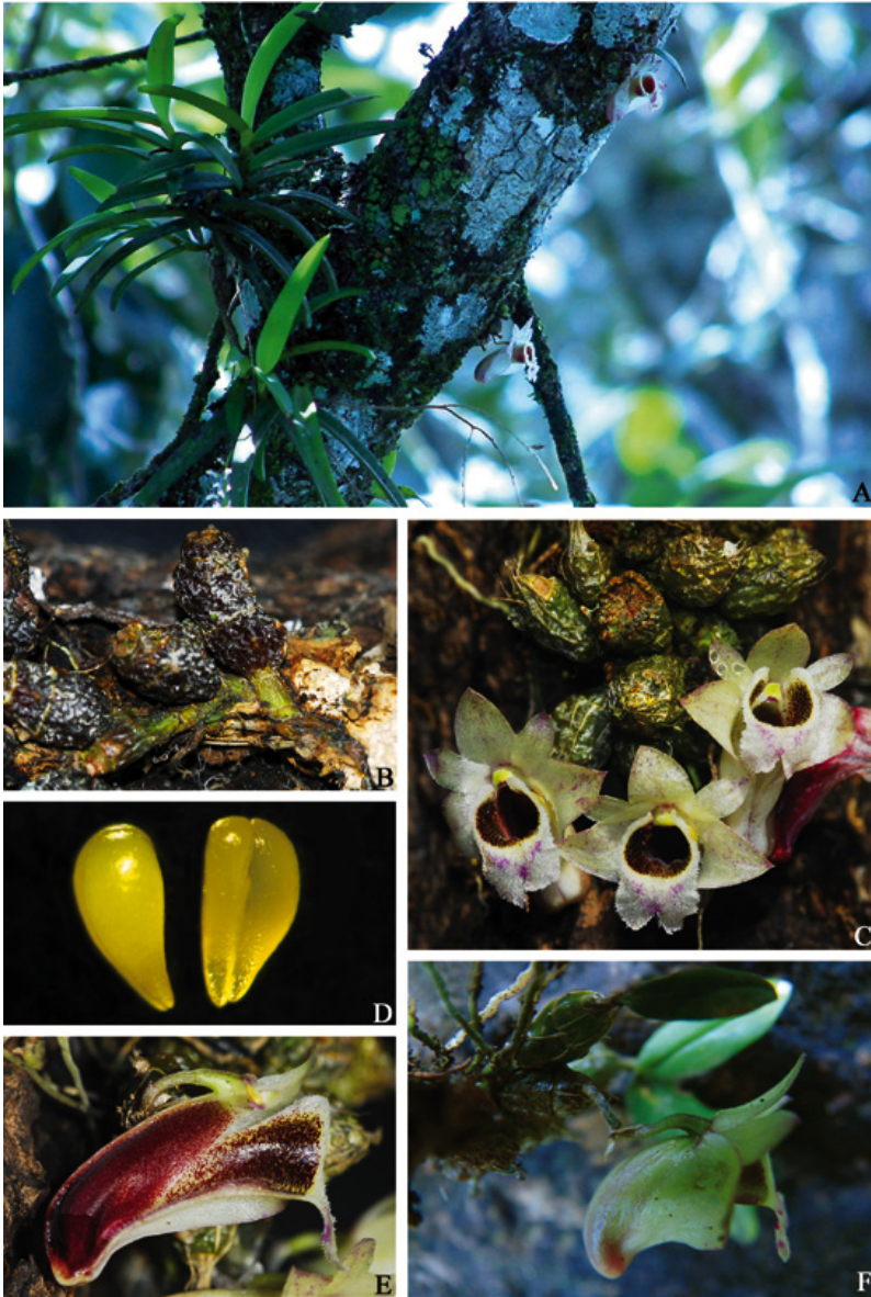
Fig. 1. Dendrobium hekouense (in the type locality). — A: Plants on tree trunk. — B: Rhizome and pseudobulbs. — C: Flowering plants. — D: Pollinia. — E: Flower, longitudinal section. — F: Flower, side view.

from leafless pseudobulb, lateral, 1-flowered; peduncle 4–4.5 mm long, with 1 membranous cup-shaped sheath at base; bracts membranous, ovate, 2–2.5 mm long; pedicel and ovary 6–7 mm long. Flowers spreading horizontally. Sepals and petals white, with a purple midvein, abaxially grey-green; lip white, densely maroon-spotted on disc and lateral lobes and with purple-red spots on mid-lobe; dorsal sepals broadly ovate, 7–7.5 mm long, 5.5–6 mm wide, apex acute; lateral sepals obliquely ovate-triangular,