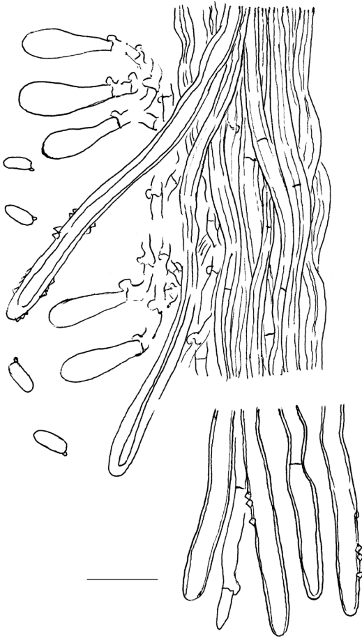
Fig. 3. Junghuhnia micropora (from holotype). Trama, hymenium and basidiospores (above), hyphae from dissepiment edge (below). Scale bar = 10 \mu\text{m} .

pale-ochraceous, partly agglutinated, more or less fragile, 0.5–3 mm thick. No distinct odour, taste mild. Hyphal structure dimitic. Upper surface and context consisting of very thick-walled yellowish, mostly acyanophilous skeletal hyphae, 3–6.2 \mu\text{m} wide, arranged in dense bundles. Hyphae in tube trama subparallel; skeletal hyphae dominating, very densely arranged, partly glued together, narrow, subsolid with capillary lumen, yellowish in CB, very faintly amyloid, 1.1–2 \mu\text{m} wide; generative hyphae very rare, thin-walled, clamped, 1.5–2 \mu\text{m} wide. Dissepiment edges consisting of round-tipped skeletal hyphae and pseudocystidia. Subhymenium indistinct. Pseudocystidia abundant, very irregular in shape — clavate, carrot-shaped or rarely