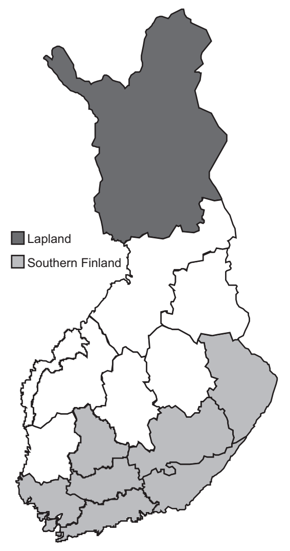
Fig. 1. Map of Finland showing the study areas.

tial occurrence, temporal occurrence and sex (Table 1). The spatial occurrence was coded as the locality (either from Lapland or southern Finland). For the temporal occurrence, animals which lived before 1970 were considered to belong to the pre-raccoon-dog population and the ones that were killed after 1970 were considered to belong to the post-raccoon-dog population. The year 1970 was chosen as a cut point, because prior to 1970 the raccoon dog population was scarce in Finland but increased rapidly thereafter (Helle & Kauhala 1991).