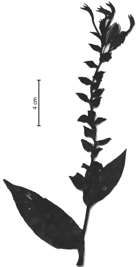
Fig. 2. Holotype of Psilochilus antioquiensis .

in wet montane and cloud forests up to about 2000 m a.s.l. (Rothacker 2005). Just four Psilochilus species have been reported from Colombia so far (Ortiz-Valdivieso & Uribe-Vélez 2007, Kolanowska & Szlachetko 2012), and only P.