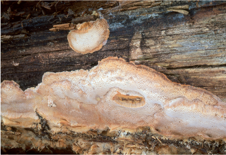
Fig. 1. Aurantiporus priscus growing on decayed trunk of Pinus sylvestris . Specimen Niemelä 7082 et al. (H).

are based on those collections. Specimens of the Helsinki University herbarium (H) were studied.