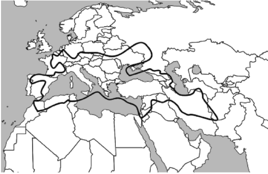
Fig. 1. Total distribution area of the genus Dichoropetalum .

primariis 4–6 (non 2–3), caulibus erectis, foliis 5–6 (non ascendentibus, foliis 2–3), foliis caulinis superioribus longis, parenchymis mesocarpium lignescentibus, vittis commissuralibus evolutis (non nullis) distinguitur.