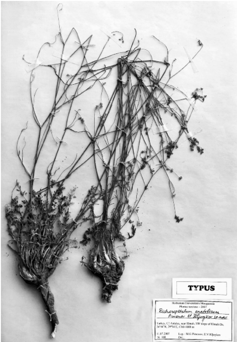
Fig. 2. Dichoropetalum anatolicum (holotype).

Perennial, glaucescent, entirely glabrous polycarpics. Roots vertical, up to 1.5–2 cm in