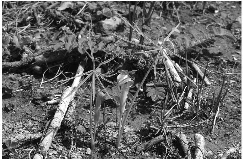
Fig. 2. Two specimens of Arisaema linearifolium flowering in the wild.

DISTRIBUTION AND HABITAT. China, Yunnan, Lijiang Prefecture, Ninglang County. Arisaema linearifolium thrives in open mixed forest, often along roadsides below Pinus yunnanensis , Quercus pannosa , and Berberis sp. It seems to be local and occurs in rocky lands together with