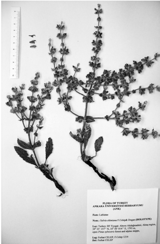
Fig. 1. Habit of Salvia ekimiana (holotype).

Perennial herbs with a woody rootstock. Stems ascending to erect, 10–30(–40) cm, branched or not, densely eglandular lanate. Leaves mostly basal, mainly oblong (ovate to oblong or oblanceolate) ca. 2.5–7 × 1–2.5 cm, greyish-green, densely eglandular lanate, rugose, margins crenulate to serrate, petiole up to (10–)15–30(–45) mm. Inflorescence widely branched, candelabriform or not, densely eglandular lanate. Verticillasters 4–12, each verticillaster with 4–10 flowers, internodes 0.5–2 cm. Bracts broadly ovate, 0.3–1.5 × 0.2–1.2 cm, densely lanate. Pedicels 2–3 mm. Calyx greyish with violet stripe, tubular to campanulate, 7–11 mm, up to 13 mm in fruit, scarcely expanding in fruit, densely eglandular lanate hairy, teeth 0.7–0.8 mm, shortly spinulose. Corolla white with lilac hood, 7–11 mm, tube 4–7 mm, upper lip ca. 3.5–4.2 mm, scarcely falcate. Stamens 2, type B; staminal connectives clearly longer than filaments. Style glabrous, 8–12 mm, long exerted from corolla lips and divided in two parts at apex. Nutlets rounded-triangular, 2.7–2.9 × 2.2–2.5 mm, greenish to brown and slightly tuberculate surface. Flowering in June, fruiting from July to August.