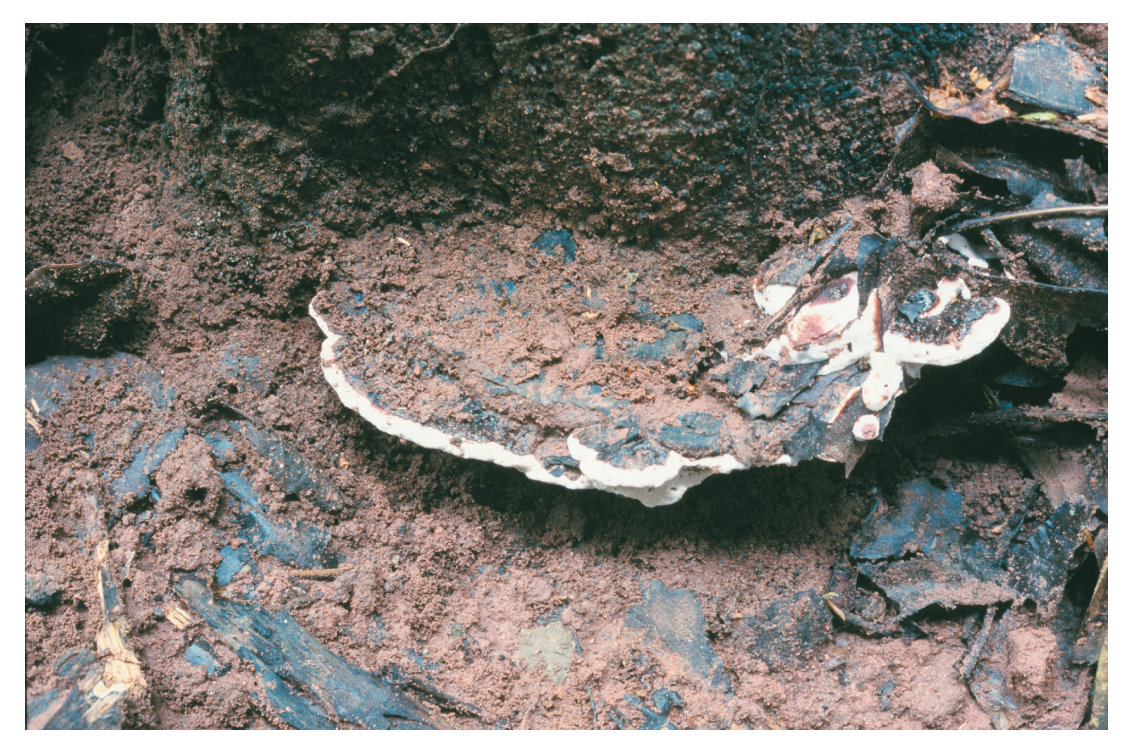
Fig. 5. Abundisporus fuscopurpureus (Pers.) Ryvarden. A fresh pileate basidiocarp, specimen Dai 3098e . in situ , × 0.4.

Perenniporia podocarpi was described from New Zealand (Buchanan 1992). Its basidiocarps are perennial, pore surface is white to cream coloured, and pores are larger (1–2 per mm) than in P. piceicola . The lack of cystidia, and distinctly larger, strongly dextrinoid spores (16.4–23 × 7.5–9.5 \mu m, Decock et al. 2000) are additional characters that separate P. podocarpi from the new species.