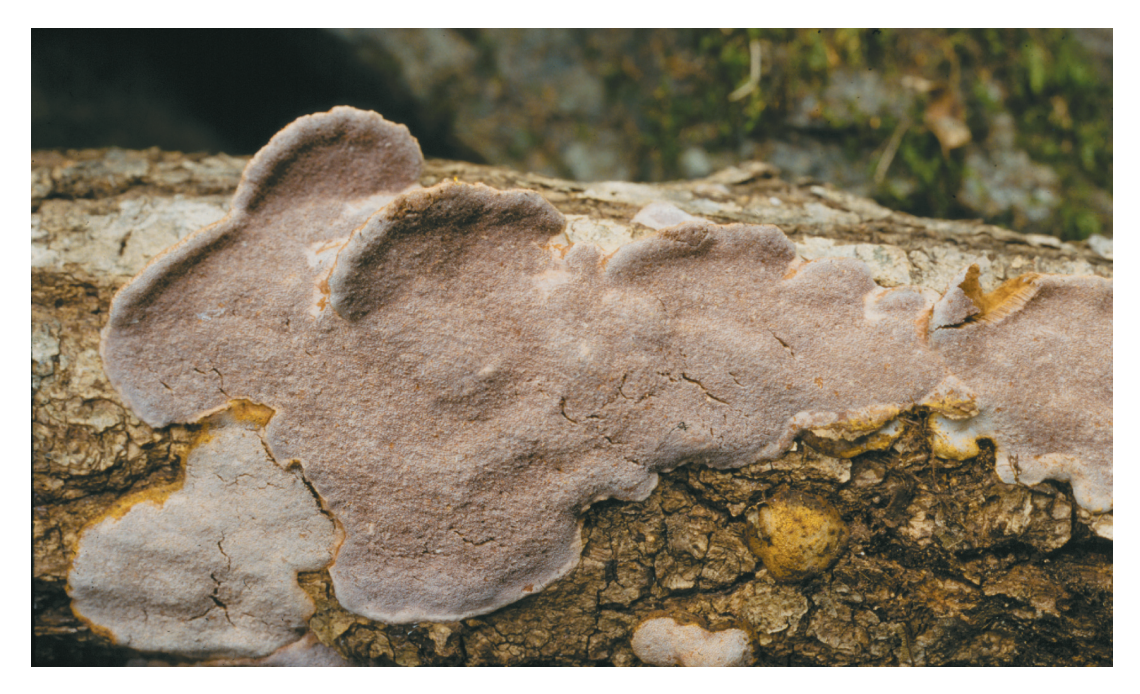
Fig. 4. Abundisporus pubertatis (Lloyd) Parmasto. A fresh pileate basidiocarp, specimen Dai 2179 . in situ , × 0.8.

Basidiocarps annual to biennial, resupinate, ca. 5 cm or more in longest dimension, soft corky when fresh, becoming tough corky when dry. Sterile margin very narrow. Pore surface pale yellowish; pores round, 2–3 per mm, tube mouths entire. Subiculum ochraceous, corky, up to 2 mm thick. Tubes yellowish ochraceous or straw coloured, corky, up to 3 mm long.