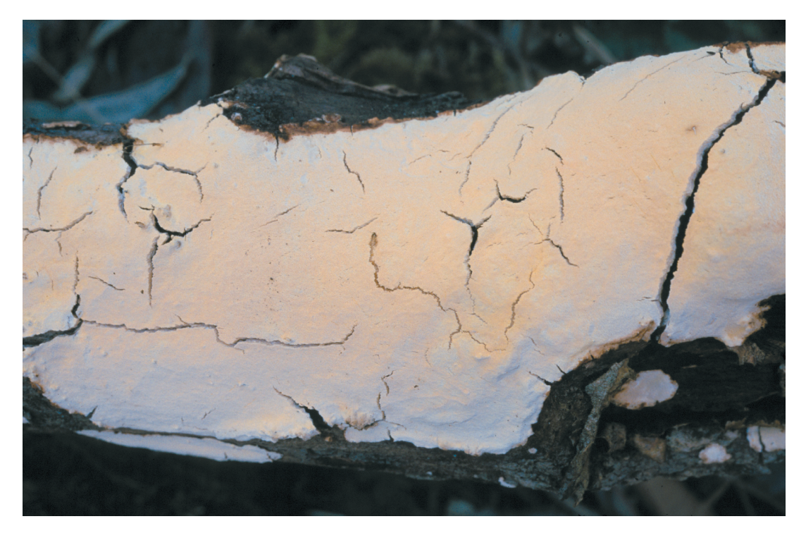
Fig. 7. Perenniporia cf. corticola (Corner) C. Decock. A fresh pileate basidiocarp, specimen Dai 3257 . in situ , × 0.5.