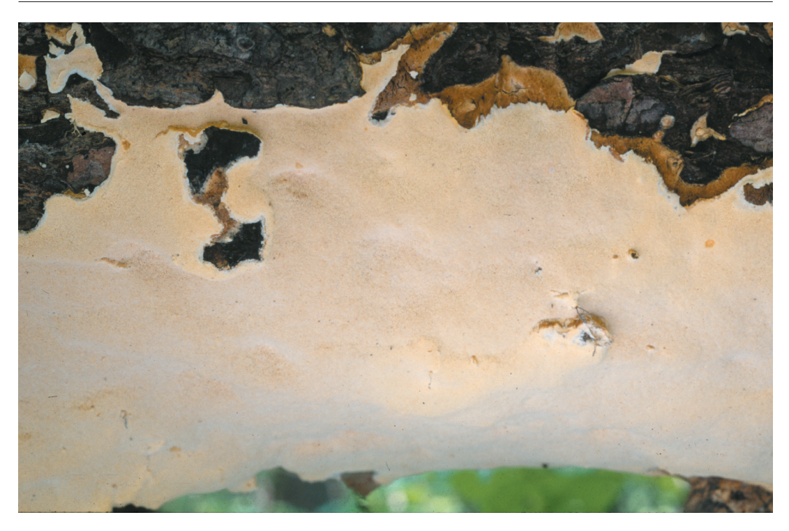
Fig. 8. Perenniporia subacida (Peck) Donk. A fresh pileate basidiocarp, specimen Dai 2138. Photograph Y.C.D., in situ, × 0.4.