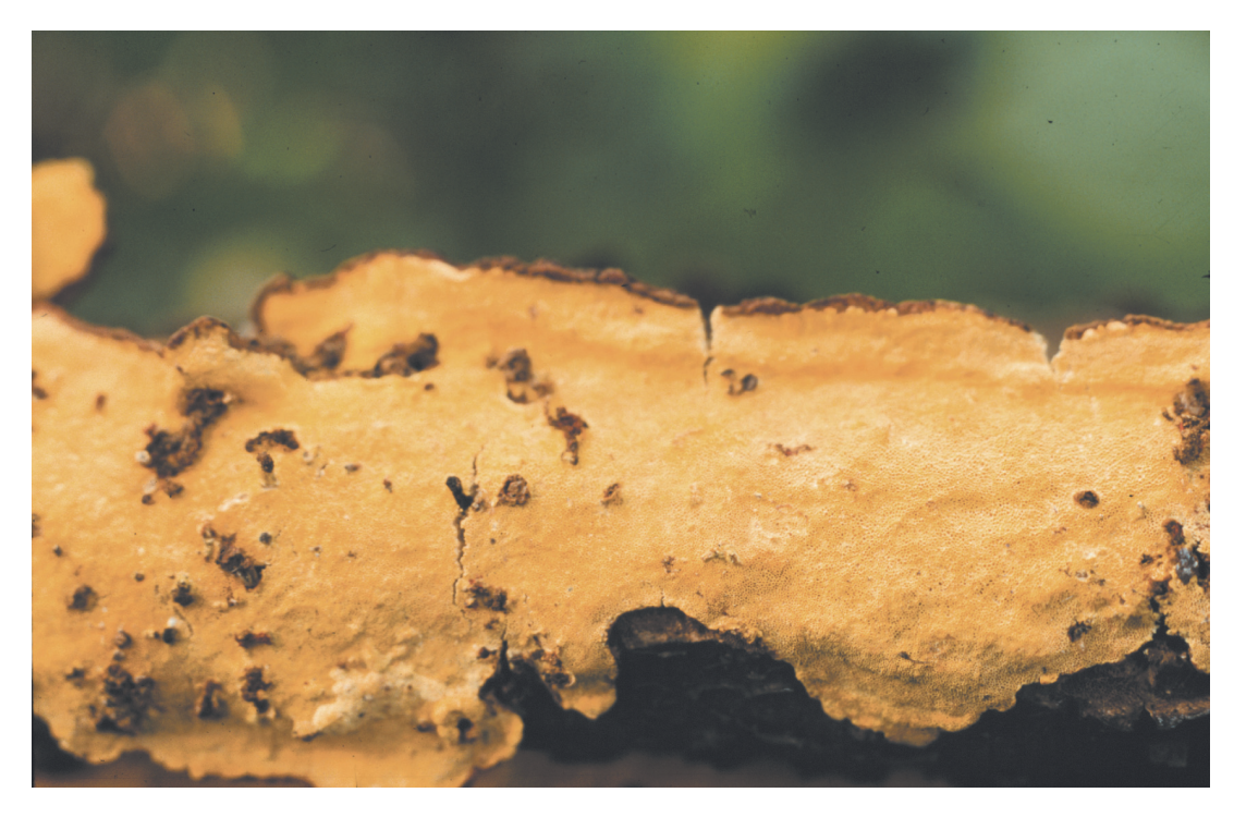
Fig. 6. Perenniporia maackiae (Bondartsev & Ljub.) Parmasto. A fresh pileate basidiocarp, specimen Dai 2397. Photograph Y.C.D., in situ, × 0.7.

oid, CB+, (4.2-)4.4-5(-5.2) \times (3.2-)3.4-4(-4.2) \ \mu\text{m} , L = 4.77 \mu m, W = 3.73 \mu m, Q = 1.28 (n = 30/1)