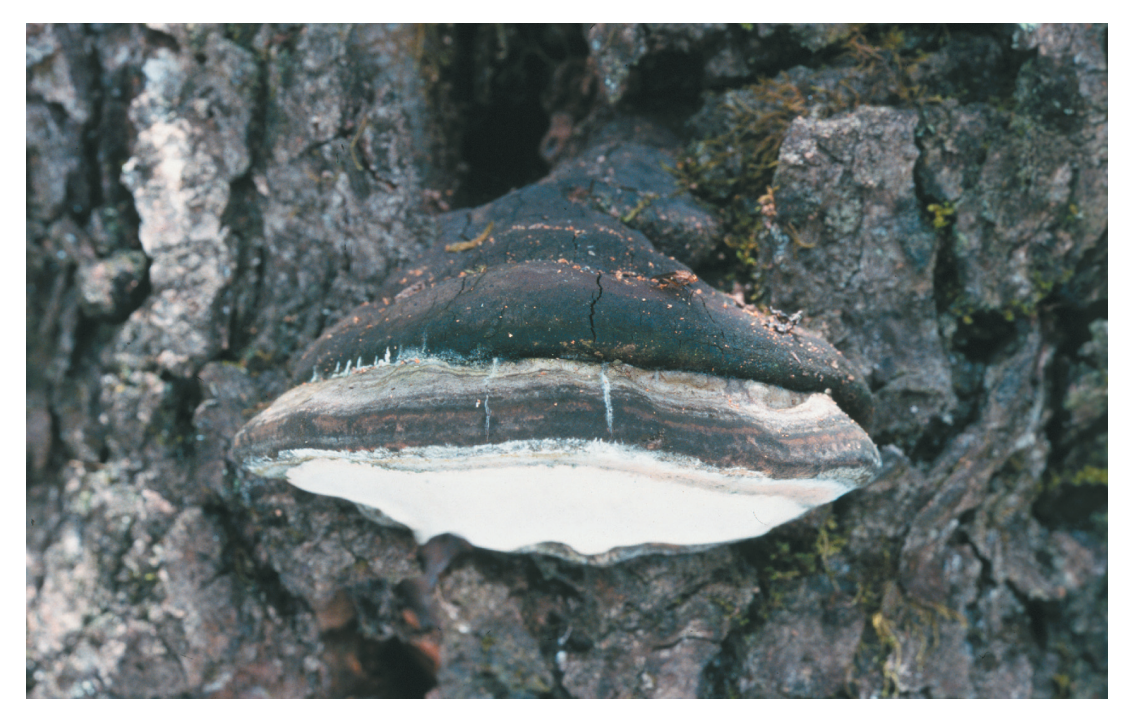
Fig. 2. Abundisporus quercicola Y.C.Dai. A fresh pileate basidiocarp, specimen Dai 3084. in situ, \times 0.6 .

to almost black, smooth, concentrically zonate, margin blunt, greyish black. Pore surface white when fresh, becoming ochraceous when dry; pores round, 5–7 per mm, tube mouths entire. Context dark brown, corky, up to 3 cm thick. Tubes dull brown, paler than context, corky, up to 2 cm long, a thin layer of context present between each annual tube layer.