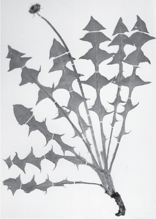
Fig. 1. Taraxacum desideratum Sonck.

integra vel paulo breviter dentata, petiolis subangustis–subalatis, ad basim leviter roseo–violaceis. Folia exteriora saepe irregulariter et non confecte paucilobata. Folia intermedia et interiora ca. 0.5–2 cm lata, ad 20 cm longa. Lobus terminalis saepe indistincte determinatus vel hastatus, 3–4 cm longus. Scapi pallidi, glabri–subglabri, floriferi, foliis superantes. Involucrum parvum, olivaceo–viride, ca. 1 cm longum, 0.7 mm latum. Squamae exteriores retroflexae, olivaceae, 2–3 mm latae, ad 8 mm longae, angustissime albomarginatae, non–corniculatae. Squamae interiores non–corniculatae. Calathium laete luteum, ligulae marginales subtus stria canescentia nota-