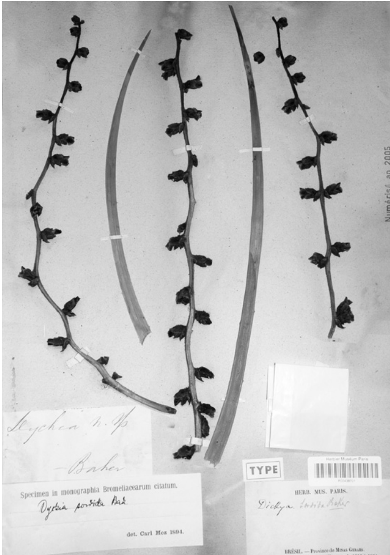
Fig. 3. Dyckia sordida (photo of type material in P).

Eupetomena macroura was observed to pollinate its flowers. Its leaf coloration varies in different habitats from green (terrestrial) to vinaceous (rupicolous). Plants with one to three inflorescences were observed in the field and cultivation.