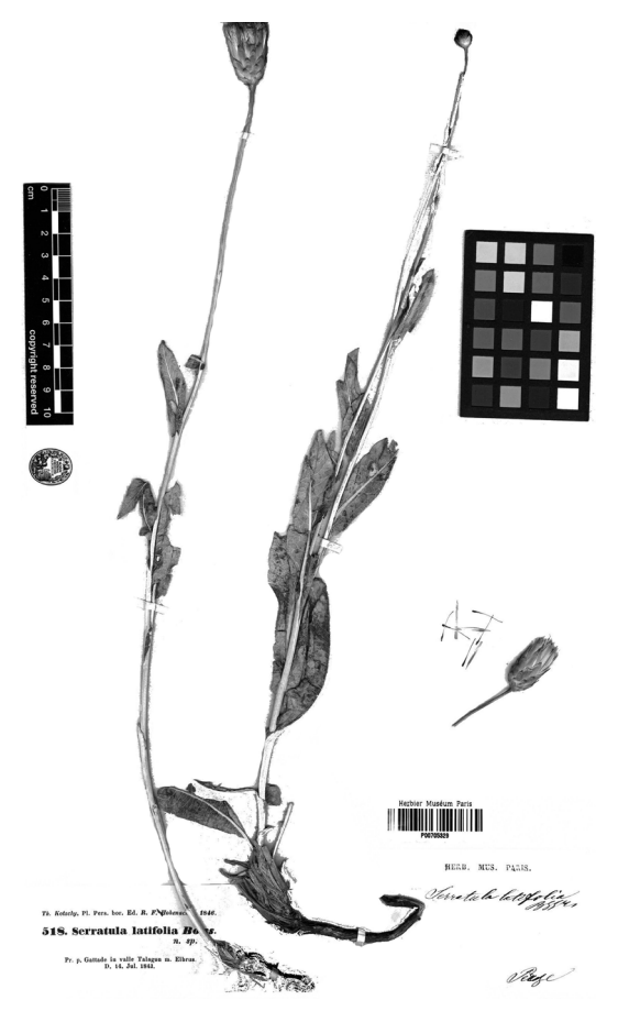
Fig. 4. Klasea latifolia (holotype); photograph through the courtesy of P.

Klasea nana is a rare endemic in NE Iran and known only from the dry-steppe zone in a mountainous region around Marichgan, near Radkan in Khorasan Province (Fig. 3). It is similar to K. latifolia in the shape of the basal and lower stem leaves and in the color of the flower (Fig. 4). Klasea latifolia is native to NE, N and W Iran with some populations occurring also in S Iran, Turkmenistan and Afghanistan. It is characterized by its glabrous habit (leaves and involucres), entire leaves or leaflets, decurrent stem leaves, spineless involucres, (7–)13–18 mm in diameter,