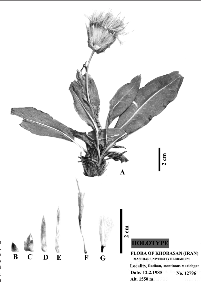
Fig. 1. Klasea nana (from the holotype). — A: Habit. — B: Outer phyllary with a short spine. — C: Spiny median phyllary. — D and E: Inner phyllaries. — F: Flower. — G: Immature achene with pappus.