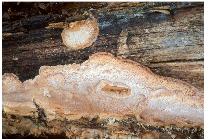
Fig. 1. Aurantiporus priscus growing on decayed trunk of Pinus sylvestris . Specimen Niemelä 7082 et al. (H).

are based on those collections. Specimens of the Helsinki University herbarium (H) were studied.