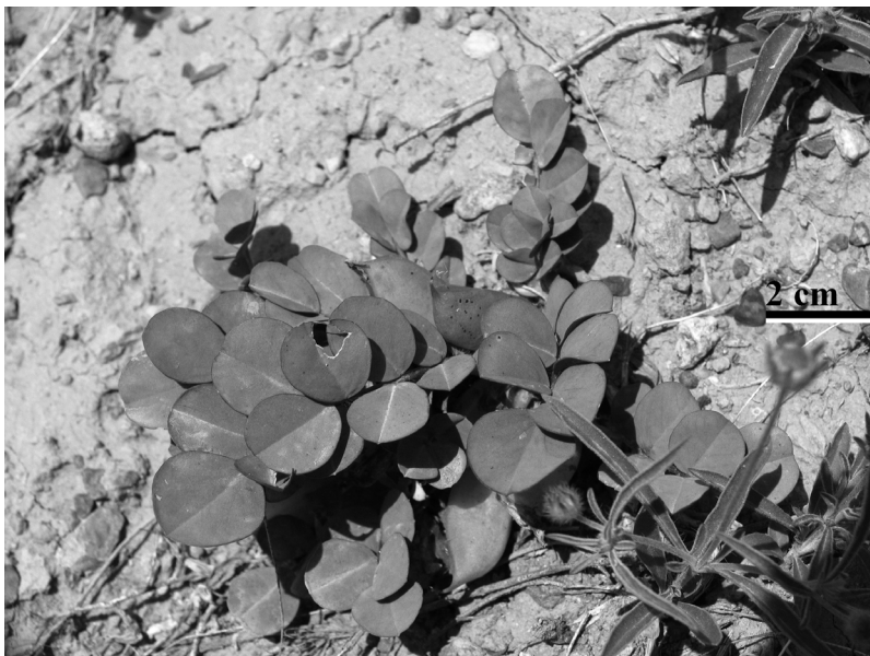
Fig. 1. Holotype of Astragalus khosrowabadensis in fruiting phase.

a shortened growth period, etc. The distribution area of the section embraces the Mediterranean region, Asia Minor, Armenia, Kurdistan, Iran, Afghanistan, Arabia, NW India and central Asia, reaching in the east as far as Altai. In the west, the plants are distributed to southern Europe, and in the north to central Europe and the steppe and forest-steppe regions of the former USSR.