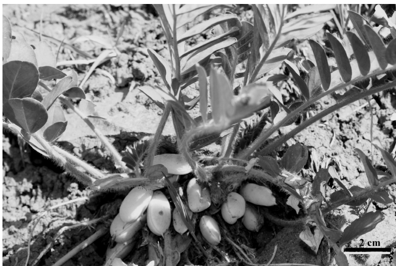
Fig. 2. Astragalus fabaceus in fruiting phase.

Bracts yellowish-membranous, 6–7 mm long, ca. 1.5 mm wide, at margins with sparse, spreading, ca. 1 mm long hairs. Flowers pedicellate, pedicels 2.5–4 mm long. Calyx ca. 20 mm long, tubular to slightly campanulate, tube straw-colored, with sparse erect to ascending, ca. 1 mm long hairs; teeth linear to subulate, equal, ca. 4 mm long, with sparse, spreading, 0.5–1 mm long hairs. Corolla yellow, glabrous. Standard ca. 34 mm long; limb ca. 7 mm wide, obovate, slightly emarginate, subabruptly contracted into a claw ca. 15 mm long. Wings 32–33 mm long; limb narrowly oblong, rounded, ca. 10 × 2.5 mm; auricle round, 2–3 mm long, claw ca. 23 mm long. Keel ca. 29 mm long; limb obovate to triangular, subacute, ca. 9 × ca. 4 mm; auricle indistinct, claw ca. 20 mm long. Stamen tube truncate at mouth. Ovary stipitate, stipe ca. 6 mm long, ellipsoid, glabrous; style glabrous. Pods stipitate, stipe ca. 6 mm long, oblong to ovaloid, 30–40 mm long, acute at both ends, rigidly coriaceous, glabrous, bilocular, many-seeded, the beak 2–3 mm long; seeds asymmetrically reniform, 4–5 mm long. Flowering in April and fruit ripening in May and June.