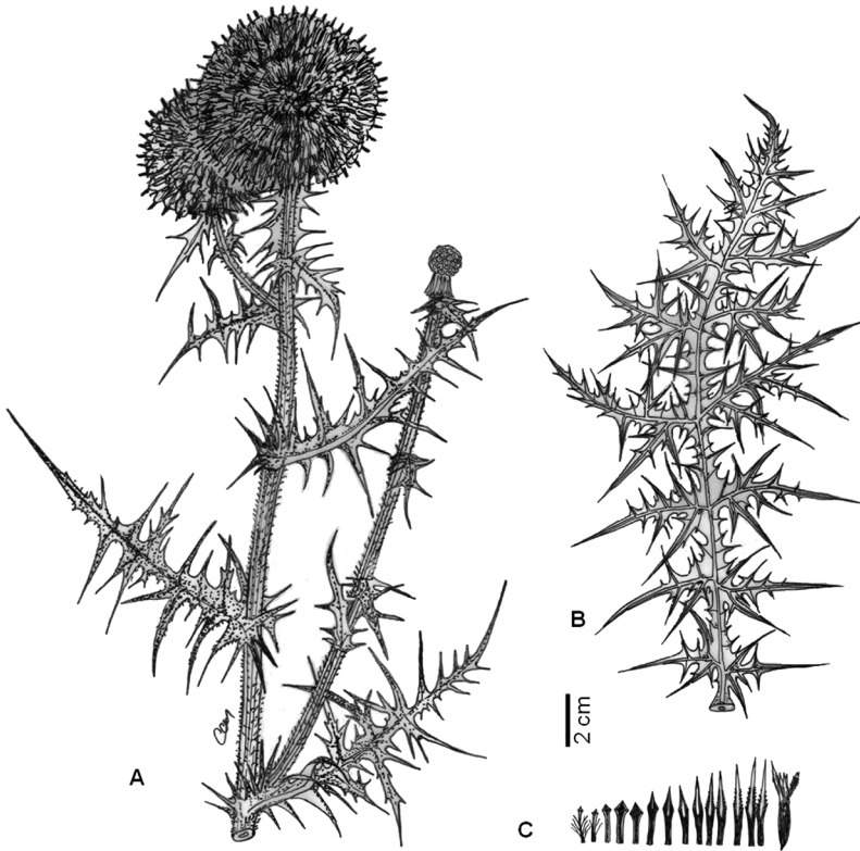
Fig. 3. Echinops borae (from the holotype). — A: Upper part of the plant with heads. — B: Lower cauline leaf. — C: Phyllaries (from outer to inner, left to right).

data gathered in the field the “Critically Endangered” status is proposed for the species (IUCN 2001).