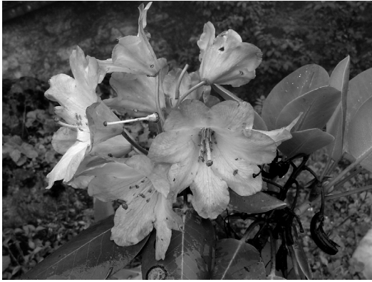
Fig. 2. Flowering specimen of Rhododendron qiaojiaense.