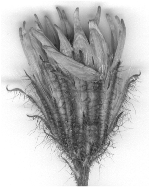
Fig. 2. Capitulum of Hieracium coldei with semi-tubular florets.

long simple hairs on both surfaces; inner leaves oblanceolate to narrowly elliptical, subacute at apex, 6–14 × 2–3 cm, with scattered, 1.5–2 mm long simple hairs on upper surface and dense 2–3 mm long hairs on margins and along midrib. Cauline leaves 1–2(–3) sessile to subamplexicaul, entire, lanceolate or narrowly lanceolate, acute at apex; upper leaf (leaves) linear, bract-like. Synflorescence with (3)5–8(15) capitula. Branches 5–10 cm long. Acladium (terminal branch of synflorescence) 1.5–3 cm. Peduncles thin, erect, with 2–4 linear bracteoles, covered by dense 0.1–0.3 mm glandular hairs, moderate to subdense stellate hairs and a few simple hairs. Involucres 10–11 mm long. Involucral bracts green with pale margins, lanceolate, up to 1.5 mm wide at base, acute at apex, with dense 2.5–3.2 mm long simple hairs and 0.2–0.4 mm long, yellow glandular hairs (ratio of simple hairs to glandular hairs 1:1) and scattered stellate hairs. Florets yellow, semi-tubular (joined at apex). Styles laterally exserted, yellow with dark microtrichomes. Achenes brown, (3.7–)3.9–4.0 mm long. Triploid ( 2n = 27 ), apomictic (Mráz & Szeląg 2004). Pollen spherical and of heterogeneous size. Flowering: end of June and July.