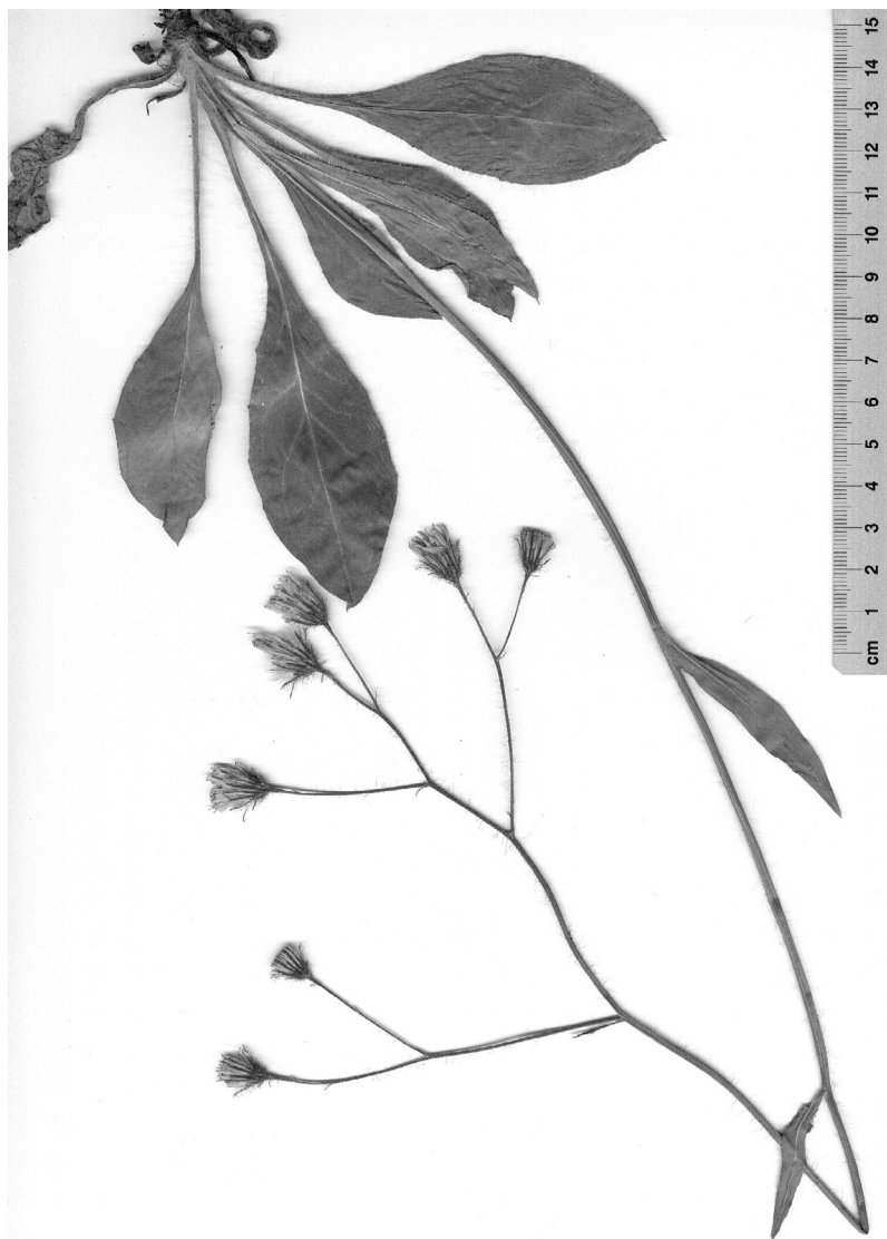
Fig. 1. Holotype of Hieracium coldei .

from the Hargita Mountains represent a new species described below.