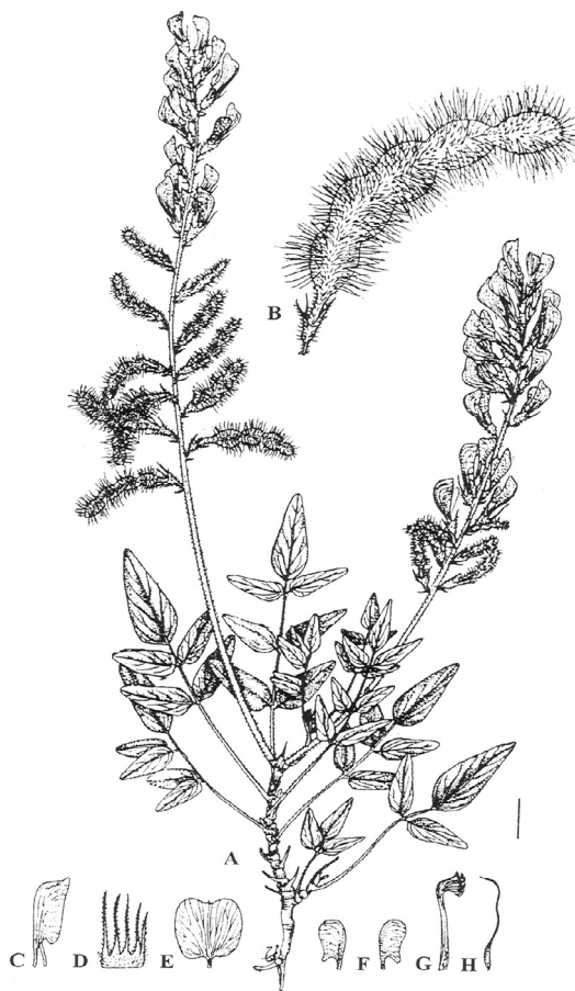
Fig. 1. Hedysarum johartchii (from holotype). — A: Habit. — B: Pod. — C: Keel. — D: Calyx. — E: Standard. — F: Wings. — G: Androecium. — H: Gynoecium. Scale bar: A = 1 cm, B = 0.3 cm, C–H = 0.5 cm.

Perennial, 18–25 cm tall; stems rather undeveloped, 2.5–3 cm, rarely reaching 5 cm. Caudex up to 20 mm long, with short, thick branches, covered with remnants of old stipules and petioles. Stipules 5–7 mm long, light brown, connate, lower triangular, upper narrowly triangular-acuminate from a wide base, adnate to petiole for 2–2.5 mm, densely covered with appressed white hairs. Leaves 5–7 cm long, petiole 2–2.5 cm long, densely covered with appressed white hairs like rachis. Leaflets in 1–3 pairs, ovate-lanceolate, ovate-elliptic to lanceolate, rounded to obtuse at apex, 15–25 × 5–10 mm, densely hairy beneath, greyish green, above less densely hairy, green. Peduncle 5–6 cm long, erect to ascending. Scapes procumbent to ascending, 1–1.5 mm thick, densely covered with appressed white hairs. Raceme rather densely many-flowered before anthesis, becoming elongated in flower and fruit and up to 15 cm long. Bracts 4–5 mm long, lanceolate, membranous, deciduous. Pedicels 1–2 mm long, hairy, upper flowers often without pedicel; flowers erect