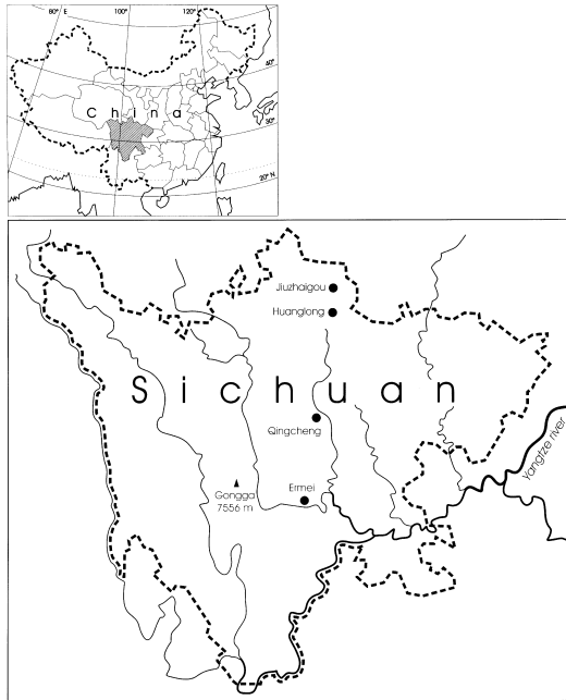
Fig. 1. Locations of the research area.

& Zhang 1992, Yuan & Sun 1995). However, these records are scattered in the general books on fungi, and knowledge of the polypores of Sichuan is highly fragmented. Many of the names in previous reports are synonyms, and the identification of the collections is often dubious.